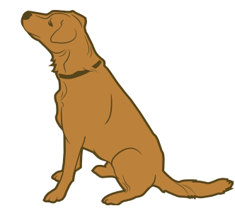
*Source: 2002 U.S. Pet Ownership and Demographics Source book by the American Veterinarian Medical Association.

It would take a scoop of 300 feet wide and 800 feet deep to dispose of all of that poop!