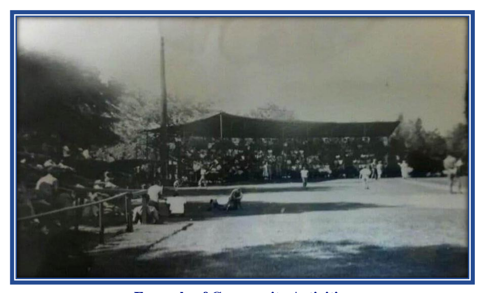
Example of Community Activities

After the mill's closure in 1983, the property was redeveloped as a retail mall in 1996 but fell short of expectations. Acquired by the City in 2001, the complex has been restored and renovated to its current state, with added landscaping, façade improvements and most recently a new roof installation. The mill is known as the first mixed use community in the Austell area containing shops, dining, recreation, etc.