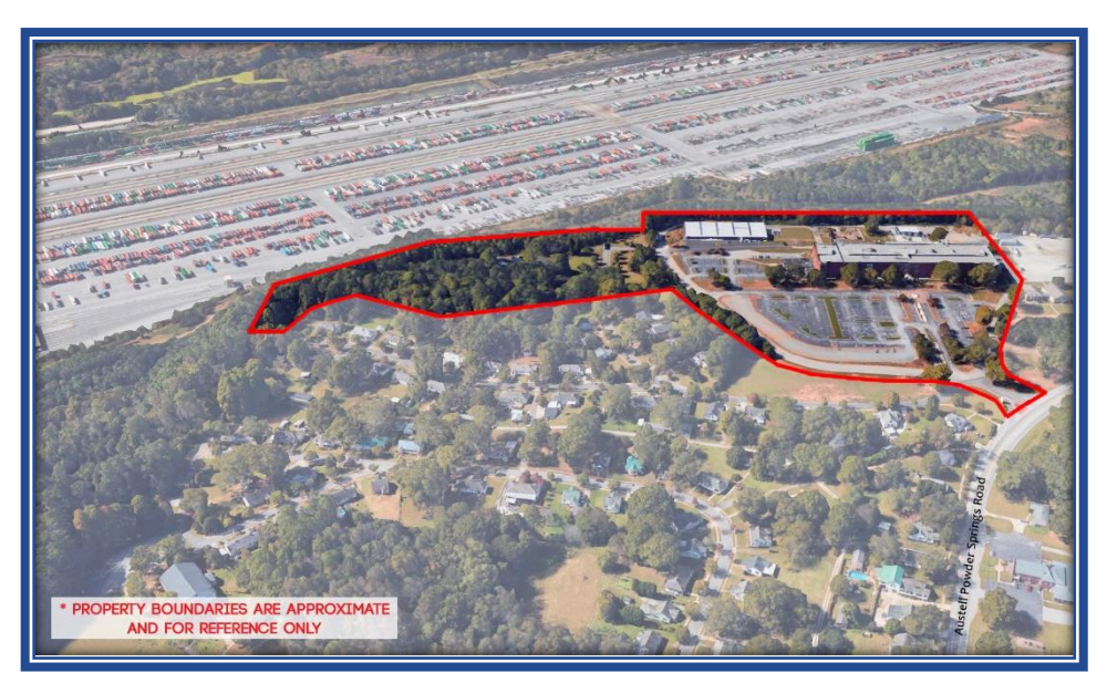
Threadmill Complex and Surrounding Campus

After the mill's closure in 1983, the property was redeveloped as a retail mall in 1996 but fell short of expectations. Acquired by the City in 2001, the complex has been restored and renovated to its current state, with added landscaping, façade improvements and most recently a new roof installation. The mill is known as the first mixed use community in the Austell area containing shops, dining, recreation, etc.