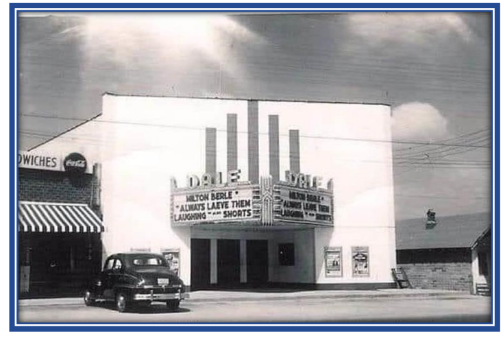
Dale Theater, Unincorporated Clarkdale Georgia, Circa 1950, located along Austell-Powder Springs Road

The redevelopment of the Threadmill Complex and the land surrounding it has been identified and supported in the City's Comprehensive Plan update. The 2017 Comprehensive Plan update envisioned the Threadmill Complex as the future neighborhood town center, with public placemaking, retail, restaurants, and housing. Recent projects, such as the scoping study of the Austell-Powder Springs Multi-Use Trail from the Cobb County Greenways & Trails Master Plan, accentuate the public desires to redevelop and make use of this area.